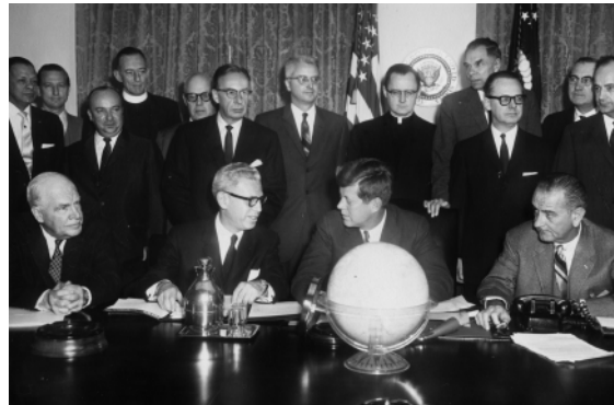
Meeting of the President's Committee on Equal Opportunity, Cabinet Room, April 11, 1961. From left: Secretary of Commerce Luther Hodges, Secretary of Labor Arthur Goldberg, President John F. Kennedy, and Vice President Lyndon B. Johnson.

Even before the Committee met for the first time in April 1961, Vice Chair Goldberg gave strong indications that an affirmative approach would permeate much of its functioning. Goldberg was determined to see his Department of Labor become a civil rights model. On March 7, 1961, the day President Kennedy announced the Order, Goldberg issued a memo to Department of Labor employees on the White House initiative, calling it “a vigorous, positive program to ensure that all Americans . . . will have equal access to employment opportunities.” 10 He included a call for affirmative action in federal employment: