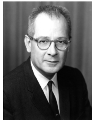
Willard Wirtz served as Secretary of Labor from 1962 to 1969.

This part suggested to apprenticeship programs, in effect, that if they enlisted enough minority applicants to satisfy the government, the bureau did not need to know what selection process was used. So the apprenticeship program could continue to allow a considerable degree of family favoritism as long as there was some unspecified increase in participation by minorities. This approach made two concessions to labor and management: they could keep the family-