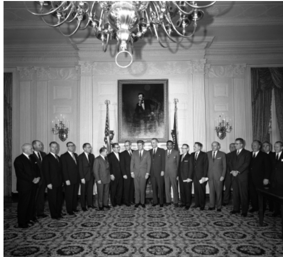
Officials from 20 of the nation’s leading companies pose during the ceremony signing the Plans for Progress by the President’s Committee on Equal Opportunity, State Dining Room, January 17, 1963.

Kennedy proved to be prophetic. Committee members quickly realized the potential of Lockheed-style voluntary compliance efforts both to expand the scope of the cash-strapped PCEEO and also to free contracting agencies to concentrate on compliance and other responsibilities under the Order. 27 With the President’s backing, the Committee decided to promote Plans for Progress (PFP) throughout the entire defense contracting sector. PFP was the most innovative effort of the PCEEO and quickly became one of its principal means for implementing affirmative action. PFP agreements were to be tailored to each firm, but all would include the following elements: a statement of policy in support of equal employment opportunity, a list of specific steps the firm planned to take to implement it, and specific types of assistance the PCEEO would provide.